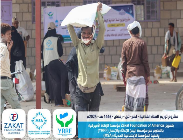
مشروع توزيع السلة الغذائية - لحج - تين - رمضان - 1446 هـ - 2025م بتمويل Zakat Foundation of America مؤسسة الزكاة الأميركية بالتعاون مع مؤسسة اليمن للإغاثة والإعمار (YRRF) وتنفيذ المؤسسة الإجتماعية الحديثة (MSA)