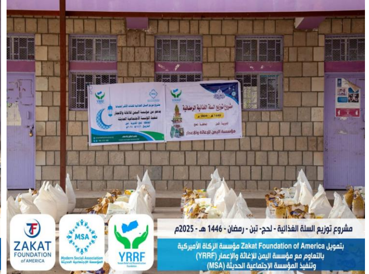
مشروع توزيع السلة الغذائية - لحج - تين - رمضان - 1446 هـ - 2025م بتمويل Zakat Foundation of America مؤسسة الزكاة الأميركية بالتعاون مع مؤسسة اليمن للإغاثة والإعمار (YRRF) وتنفيذ المؤسسة الإجتماعية الحديثة (MSA)