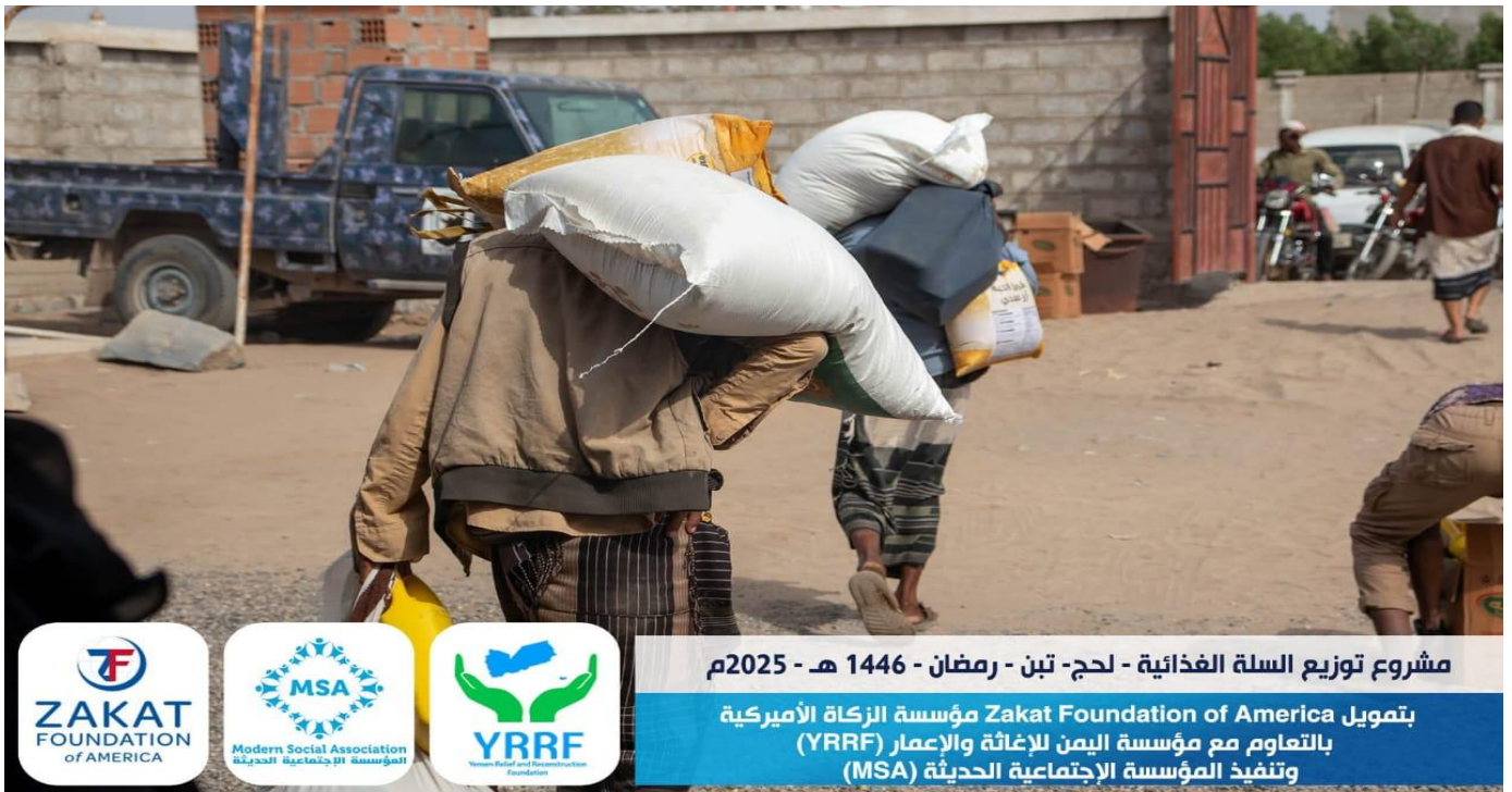
مشروع توزيع السلة الغذائية - لحج - تين - رمضان - 1446 هـ - 2025م بتمويل Zakat Foundation of America مؤسسة الزكاة الأميركية بالتعاون مع مؤسسة اليمن للإغاثة والإعمار (YRRF) وتنفيذ المؤسسة الإجتماعية الحديثة (MSA)